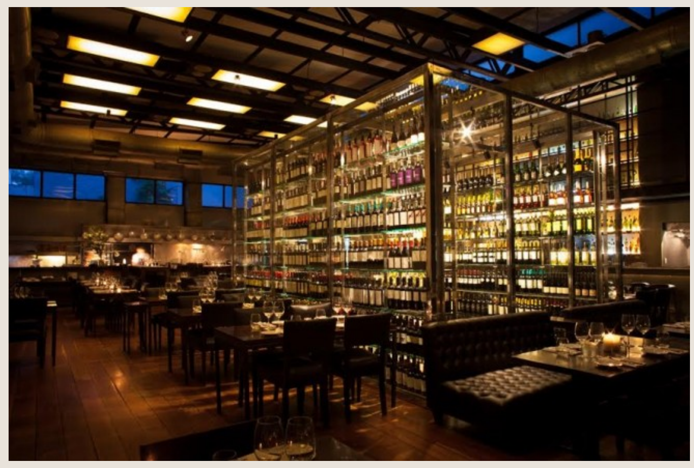
Sucre Restaurant

When Sucre 's new owners – London's Gaucho Group – took charge of affairs at the Belgrano restaurant in 2013, the wine cellar was the first port of call for a revamp. Always a focal point in the middle of the open-plan eatery, its solid walls, however, did little to encourage curiosity. But since the