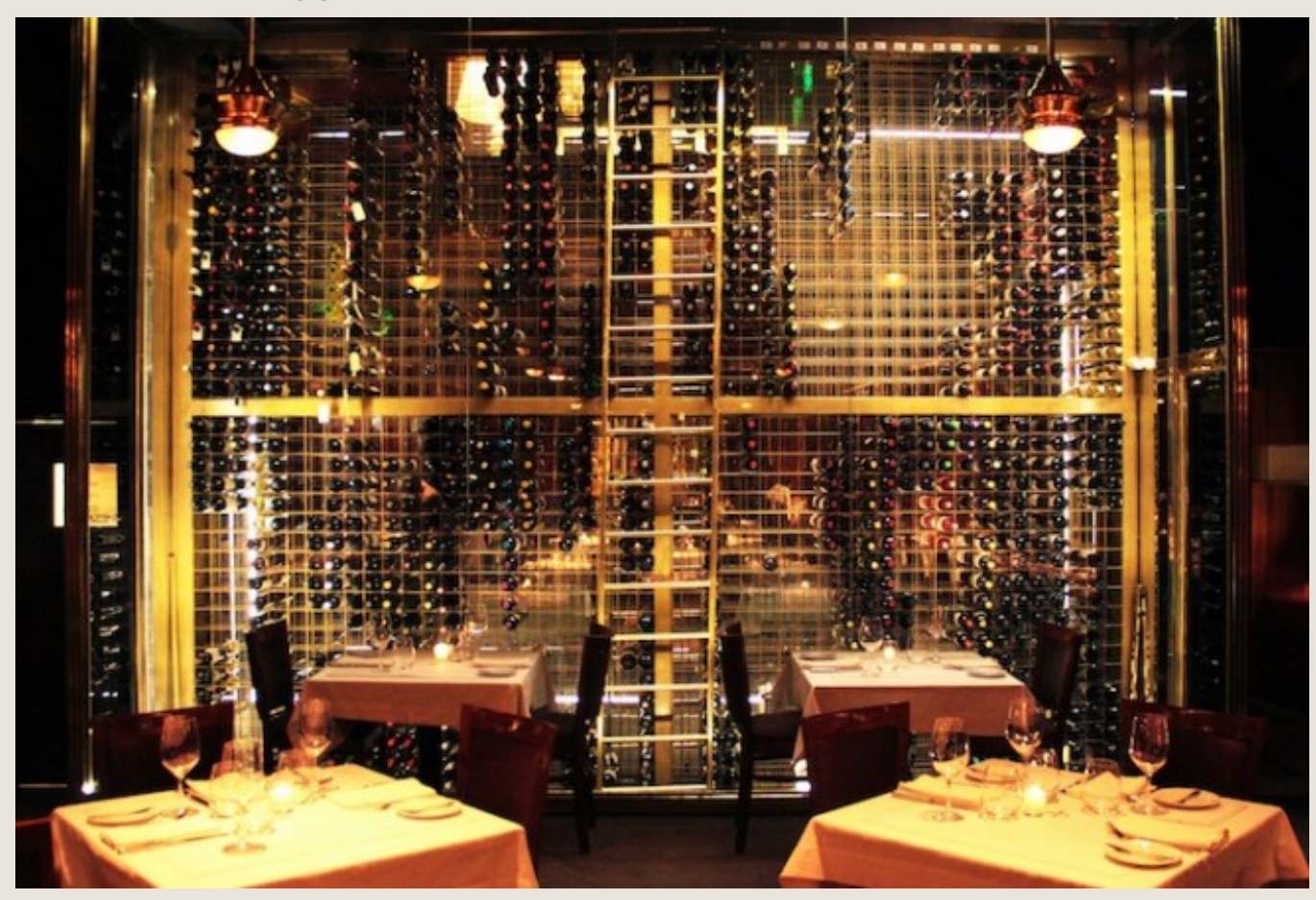
The cava at Casa Cruz; photo by Cinthia Baseler.