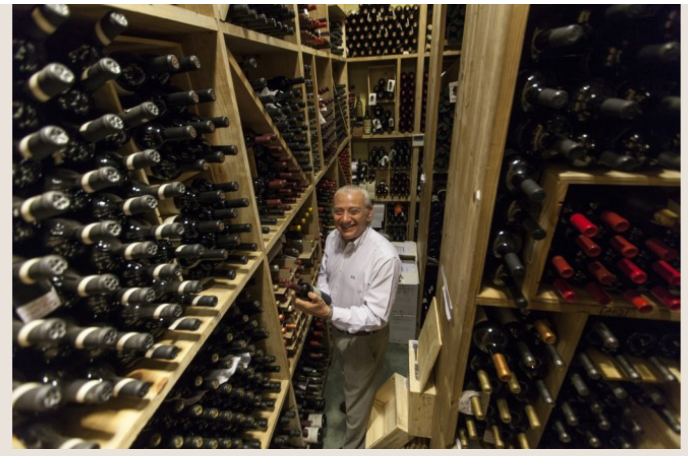
Oviedo Restaurant